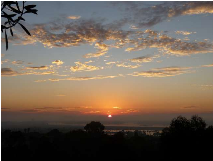
Sunset view from the Point

The Point is San Diego's best-kept secret! This beautiful outdoor setting is set on top of a hill overlooking Mission Bay and offers spectacular views. Tucked away in this space is a serene Japanese Garden.